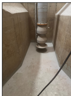
Inside Wet Well – Pump