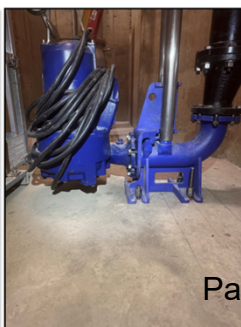
Inside Wet Well – Sump Pump