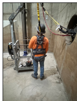
Inside the Wet Well