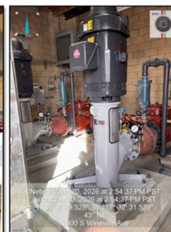
Grouting Base Plate